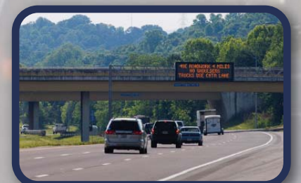
Dynamic Message Signs