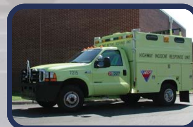
Highway Incident Response Units