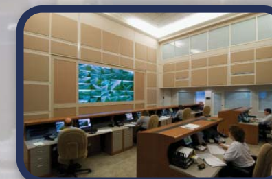
Traffic Management Center