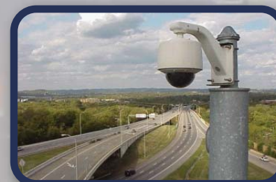
Closed Circuit Television Cameras