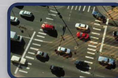
Traffic Signal Coordination System