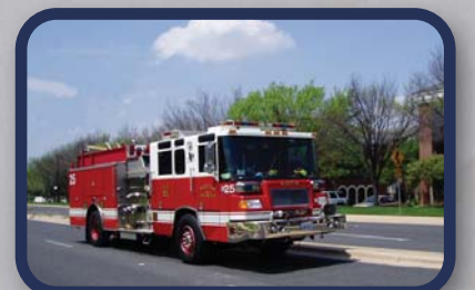
Emergency Vehicle Signal Preemption